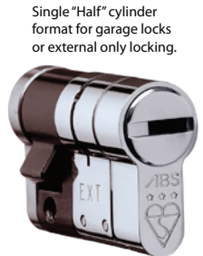
Single "Half" cylinder format for garage locks or external only locking.